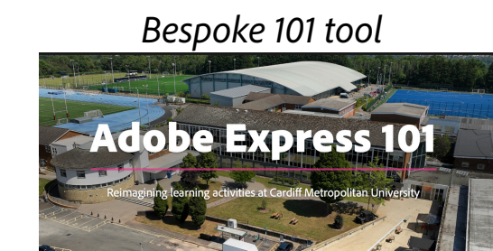
Bespoke 101 tool

Faculty use social media to celebrate their students' success and created a bespoke 101 tool to share their own experiences with other departments, socialising ideas and reducing the learning curve.