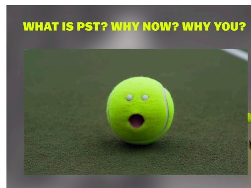
Students incorporated this into their assignment: a Dragons Den style pitch