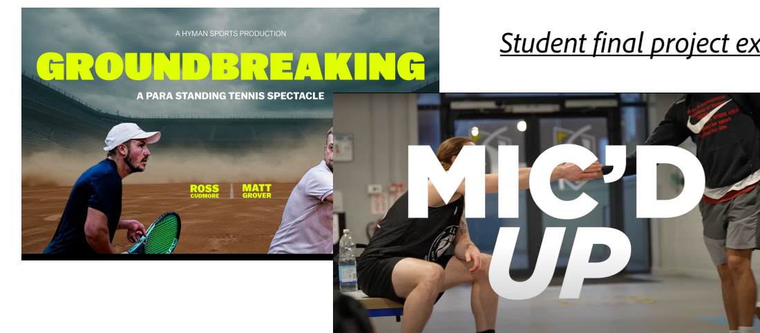
Student final project examples