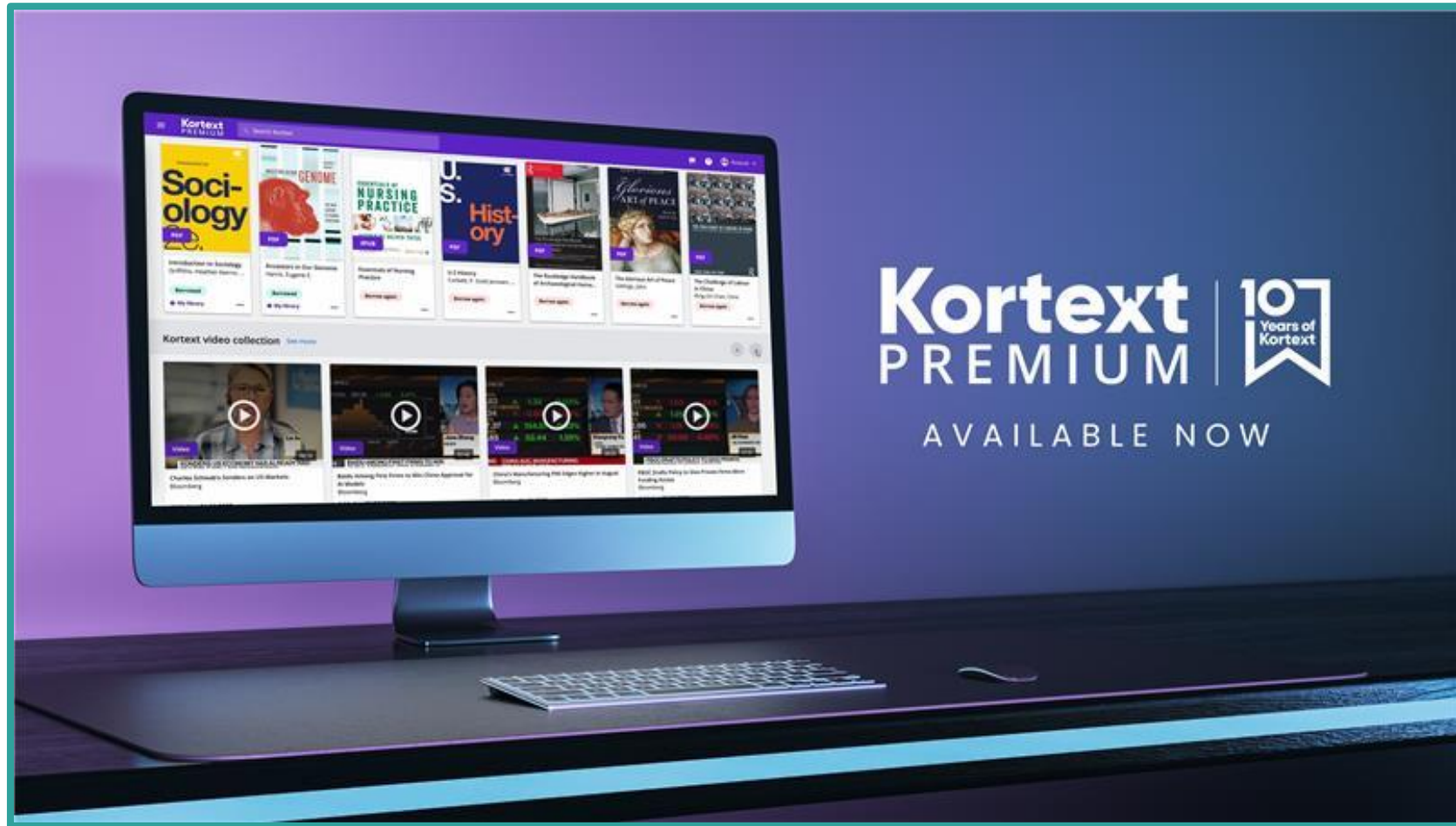
Kortex Premium Preview Video